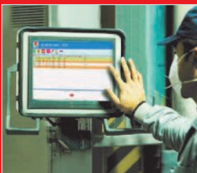
riteTIME on Touchscreen

Accessing riteTIME with their iPhone, iPad or iPod Touch your remote workers can track the work they do on projects, jobs or work orders wherever they are working.